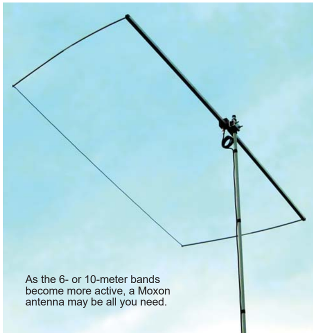
As the 6- or 10-meter bands become more active, a Moxon antenna may be all you need.

Increased solar activity is not a good thing for the lower bands. Hams who've enjoyed seeking out DX contacts on 160 through 40 meters will find their prospects reduced as the electron density of the ionosphere increases. More lower-frequency signal energy will be absorbed compared to quieter times, and less will be refracted. Noise levels at those frequencies will increase as well.